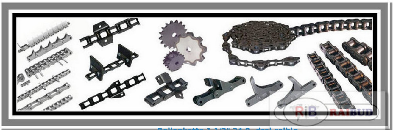
Rollenkette 1 1/2" 24 B, drei-reihig