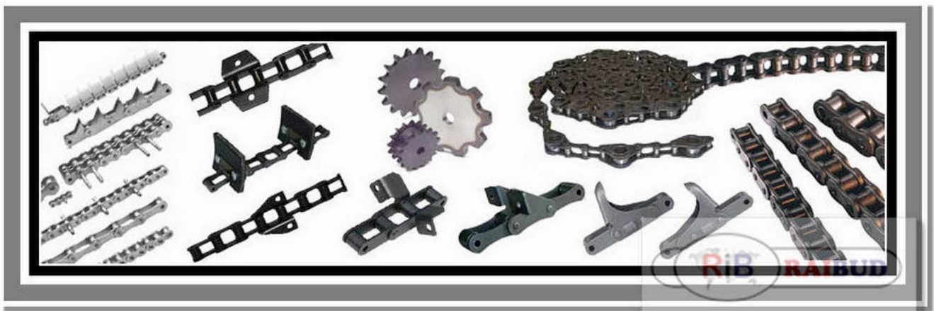
Rollenkette 19,05X11,68 12BH