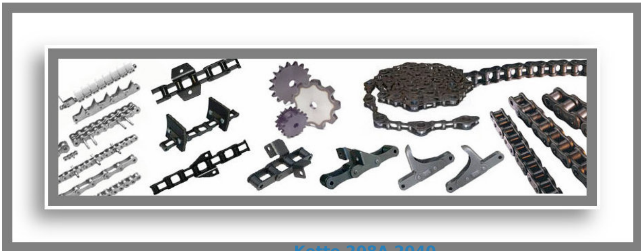
Kette 208A 2040